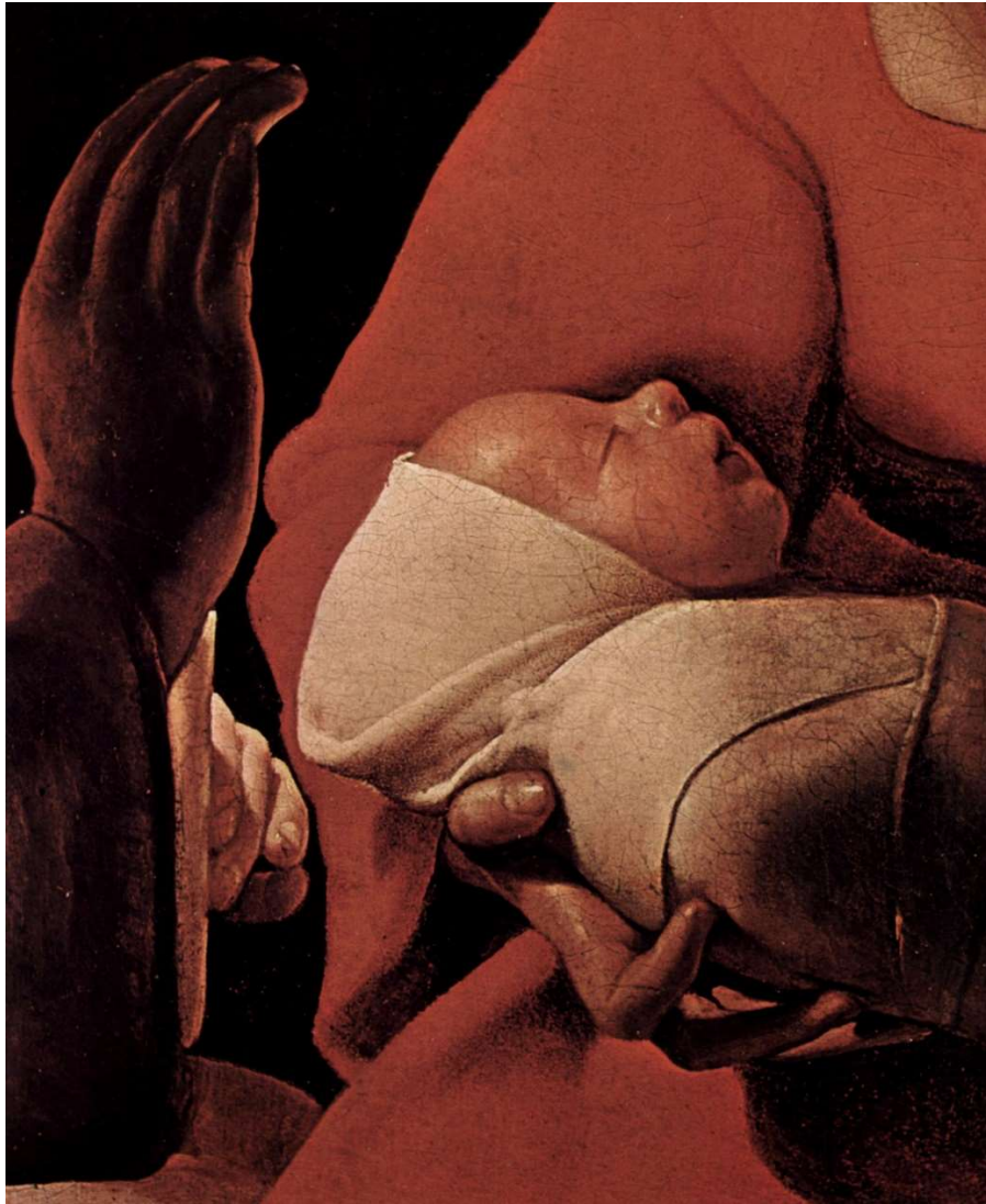
Georges du Mesnil de La Tour, 1593-1652. Birth of Christ , detail, from Art in the Christian Tradition , a project of the Vanderbilt Divinity Library, Nashville, TN.